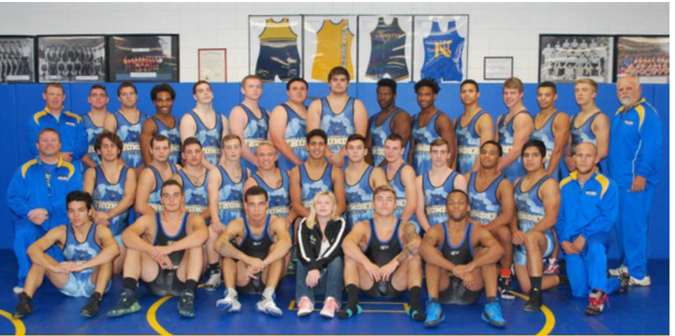
NCCC Wrestling: 2016-17 Region III champions