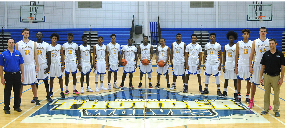
NCCC Men's Basketball: 2016-17 Region III Division II champions

For more information on our award-winning teams check out