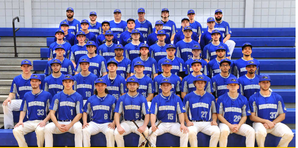
NCCC Baseball: 2017 Region III Division III champions